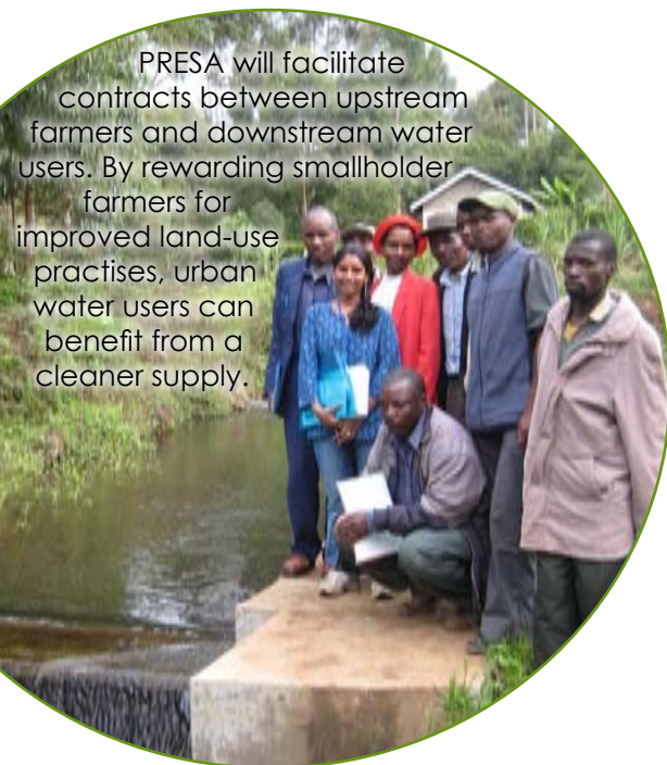
PRESA will facilitate contracts between upstream farmers and downstream water users. By rewarding smallholder farmers for improved land-use practises, urban water users can benefit from a cleaner supply.

Hundreds of thousands of smallholder farmers and residents living in the highlands of East and West Africa will benefit from fair and effective agreements between stewards and beneficiaries of ecosystem services