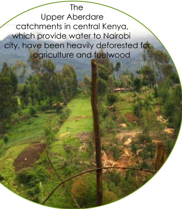
The Upper Aberdare catchments in central Kenya, which provide water to Nairobi city, have been heavily deforested for agriculture and fuelwood

IN RURAL AFRICA poor communities rely on healthy ecosystems for safe drinking water, nourishment, and a secure livelihood. These ecosystem services also extend benefits to non-residents, including urban and industrial water users and communities in flood-prone areas. Other beneficiaries include people who value the rich biodiversity of Africa, such as tourists, and local and international organizations interested in carbon offsets. However, these ecosystems have been degraded due to poor land management practices and deforestation, inflicting costs and risks on rural communities and urban users.